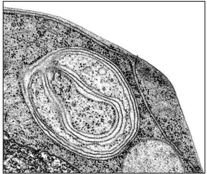
Figure 2. Visualization of ERA membranes. High-pressure freezing/freeze substitution image of an ERA to reveal the membrane content. Note that both content and delimiting membranes contain bound ribosomes, and therefore are at least partially derived from the ER.

Thus, our study revealed an important link between the UPR and autophagy and has identified a new branch of autophagy, which we term ER-phagy. This discovery extends the group of organelle-selective modes of macroautophagy: pexophagy for engulfing peroxisomes, mitophagy for engulfing mitochondria, and ER-phagy for engulfing ER membranes. Physiologically, the role of ER-phagy may be two-fold: (1) the formation of ERAs during folding stress may serve to sequester parts of the ER that are damaged or contain protein aggregates that cannot be disposed of in other ways, and (2) ER-phagy may reduce the size of the ER back to normal once the folding stress subsides. ER-phagy could therefore represent an important degradative functionality of the UPR and be an integral player in achieving homeostatic control. In this regard, ER-phagy may be analogous to the regulation of peroxisome abundance, whose biogenesis is balanced by pexophagy, and to the regulation of mitochondrial abundance, whose biogenesis is thought to be balanced by mitophagy. 6,7